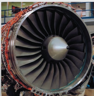
Primer-Free inserts are ideal for use in aerospace applications